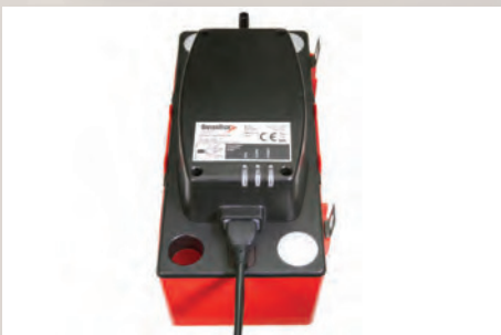
Four Inlet Holes

Shatterproof stainless steel hang tabs have hole-and-slot design for easy mounting. Tabs are located on convenient 20cm centers.