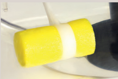
A Float that Floats

Removable check valve for easy cleaning.