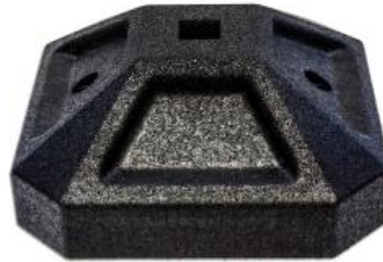
The 'Heavy Ballast' Foot

Even our standard 350 foot has a substantial 5.2kg weight – giving it greater stability compared to others available on the market