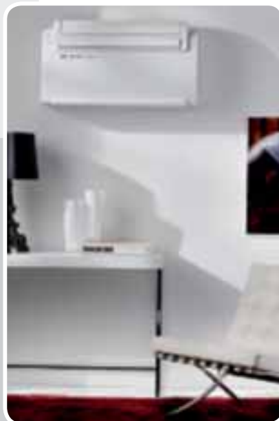
B. Installation on higher part of wall