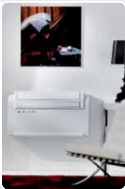
A. Installation on lower part of wall

Unico inverter DC has been designed and developed for low or high installation. Thanks to innovative technical features, a few minutes is all it takes to prepare the machine for either type of installation. The installation of the unit requires no outside work: this means no difficult procedures and reduced costs. The visual impact on the outside wall is minimal with only two small grilles installed (each 202 mm diameter).*